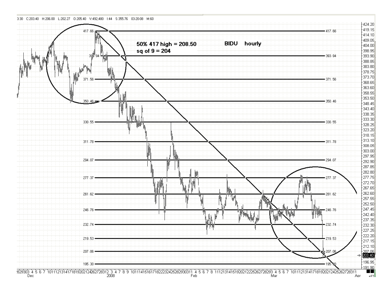
Above buy recommendation on 'upside down and backwards' pattern at top.